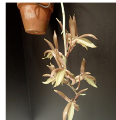
July Winning Specie: Catasetum laminatum grown by Larry Baker

September Meeting: 7:00 pm, Monday, September 18, 2017.